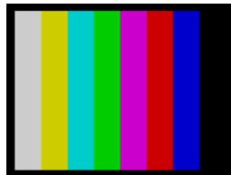
Ground Loop Isolation (After)