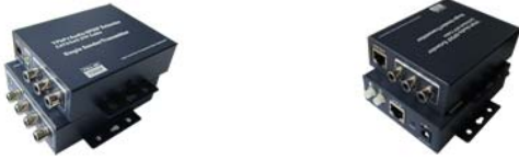
Fully HD Compatible YPbPr/Audio-SPDIF CAT5 Cable Extender